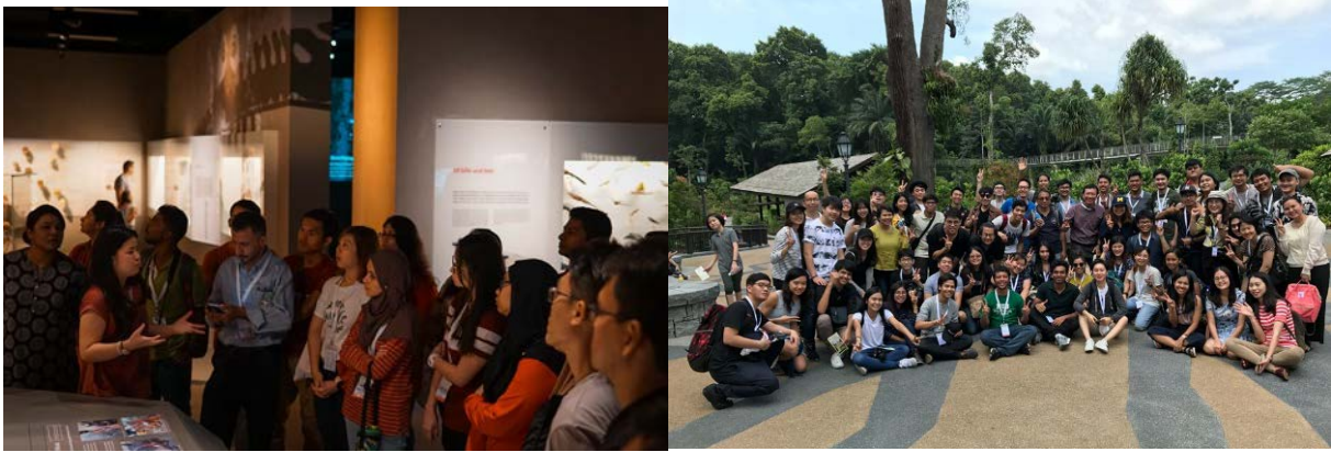
Tours to the Lee Kong Chian Natural History Museum (Left) and Singapore Botanic Gardens (Right)