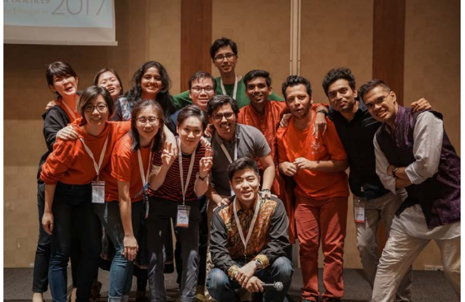
The BSGC2017 organising committee