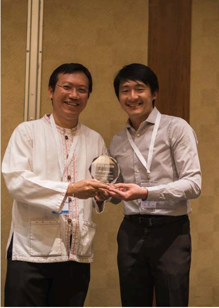
Handing over the BSGC Symbol of Hosting (introduced by the committee this year) to the hosts of BSGC in 2018, Chulalongkorn University