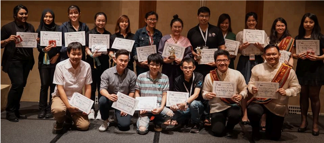
Prize winners from BSGC2017