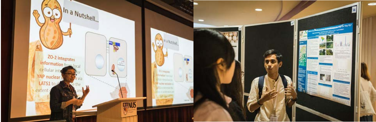
Oral and Poster presenters at BSGC2017