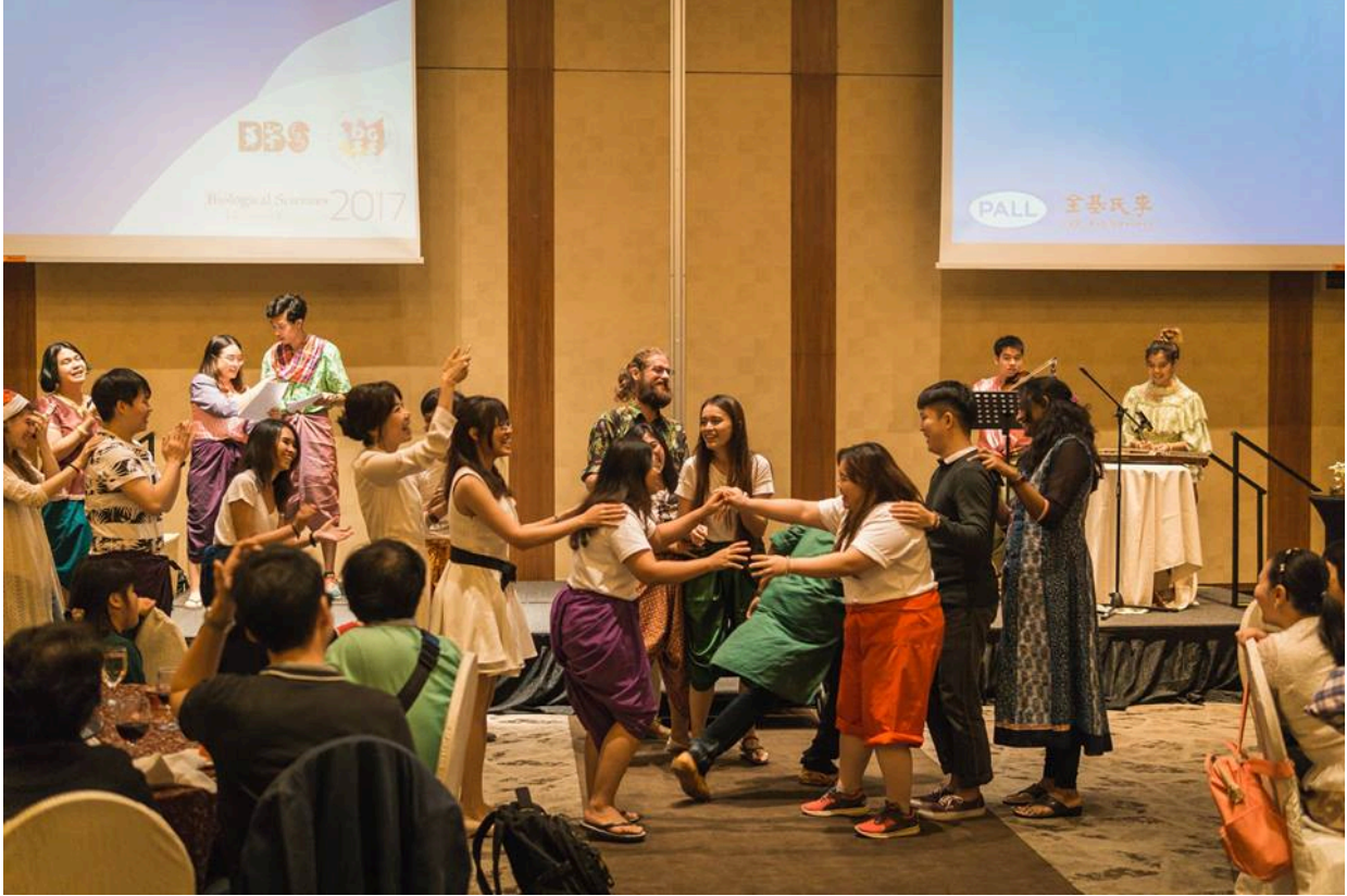
Cultural Performance by participants from Chulalongkorn University: introducing a traditional Thai game played by children