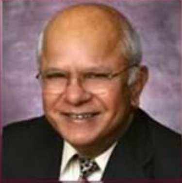
NIU Professor, Presidential Research Professor